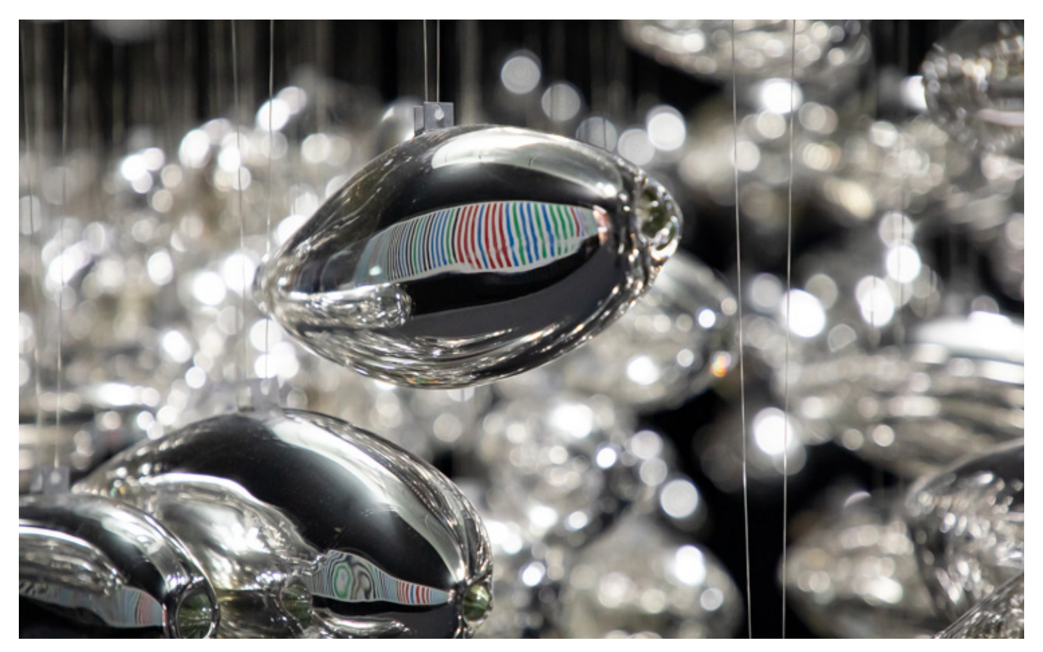
Joseph Gregory Rossano. The Salmon School, detail. Blown and mirrored glass.

"The Salmon School is a world-wide art and science collaboration aiming to highlight the imminent threat to wild salmon across the Northern hemisphere. As was demonstrated by its inclusion in the United Nations COP26 conference in 2021, the threat of extinction for wild salmon is indicative of the wider impact of the climate crisis. Wild salmon need what we need: cold, clean water. It has been a privilege to so closely work with Joseph Rossano, Museum of Glass, and so many partners and concerned individuals in Europe and North America to realize this artwork and science program. A charismatic sculptural installation of living mirrors that asks the viewer to look and reflect on their own actions in the real world, The Salmon School is an exemplar of the concept that art can change lives," said exhibition curator Benedict Heywood.