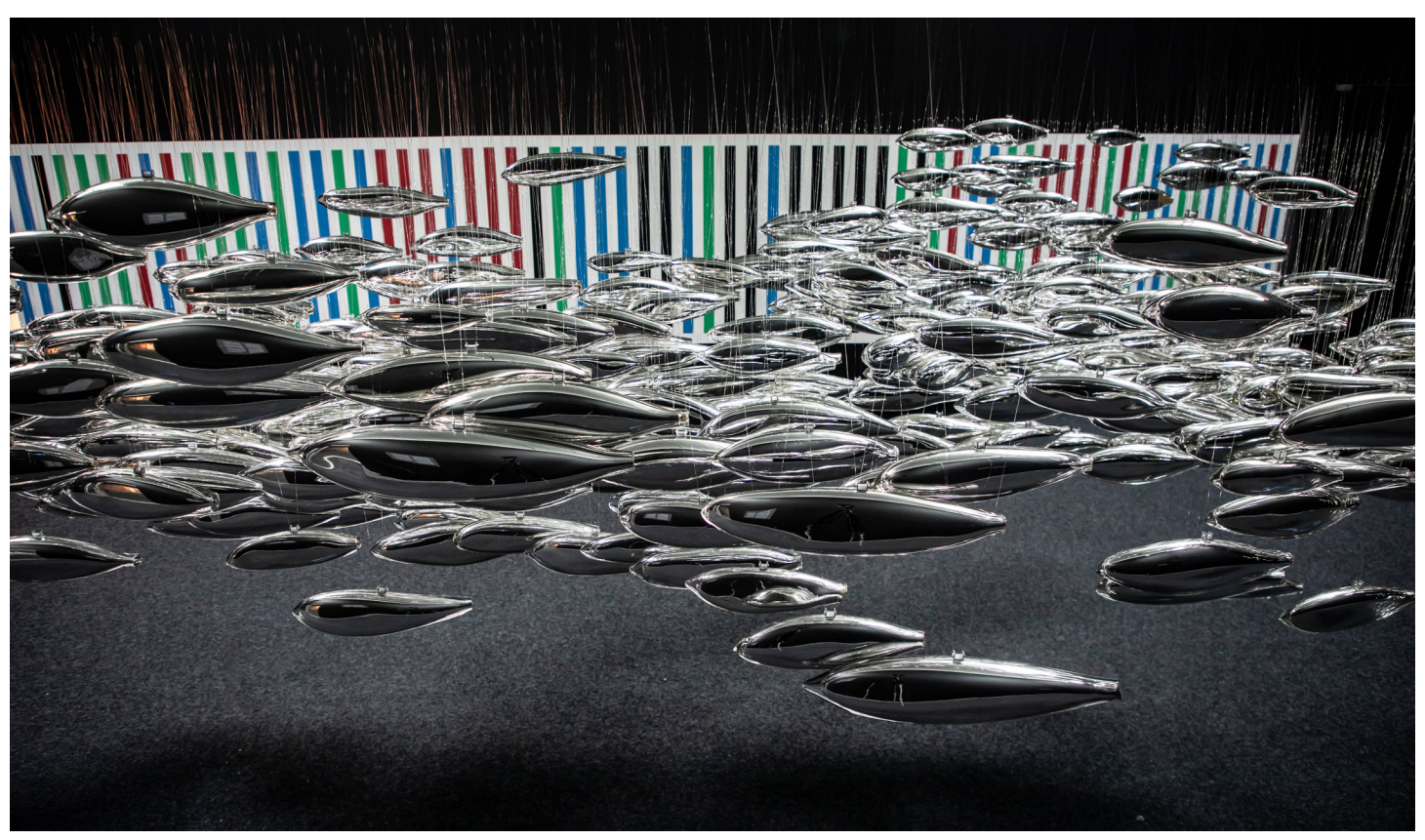
Joseph Gregory Rossano. The Salmon School, detail. Blown and mirrored glass.

After a long journey across the globe, The Salmon School returns home to reinvigorate the local conversation on conservation, environmental stewardship, and the role we all play in protecting native wildlife.