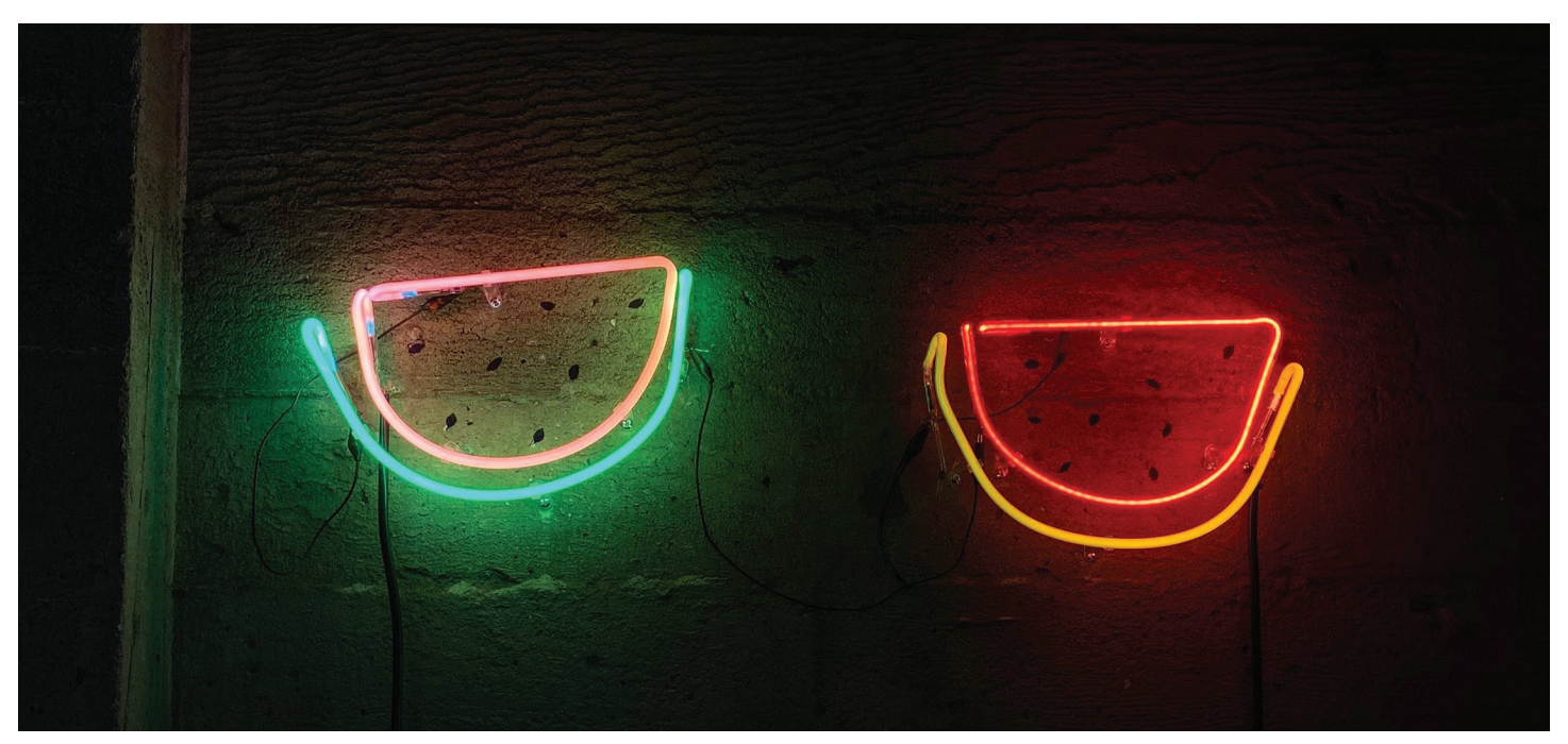
Jude Abu Zaineh (Palestinian-Canadian, born 1990). tend to grow (watermelons) , detail, 2022. Varying glass tubes and gases, electrodes; Dimensions variable.

Exhibition features artists of historically under-represented communities in the neon art form and the women who taught them.