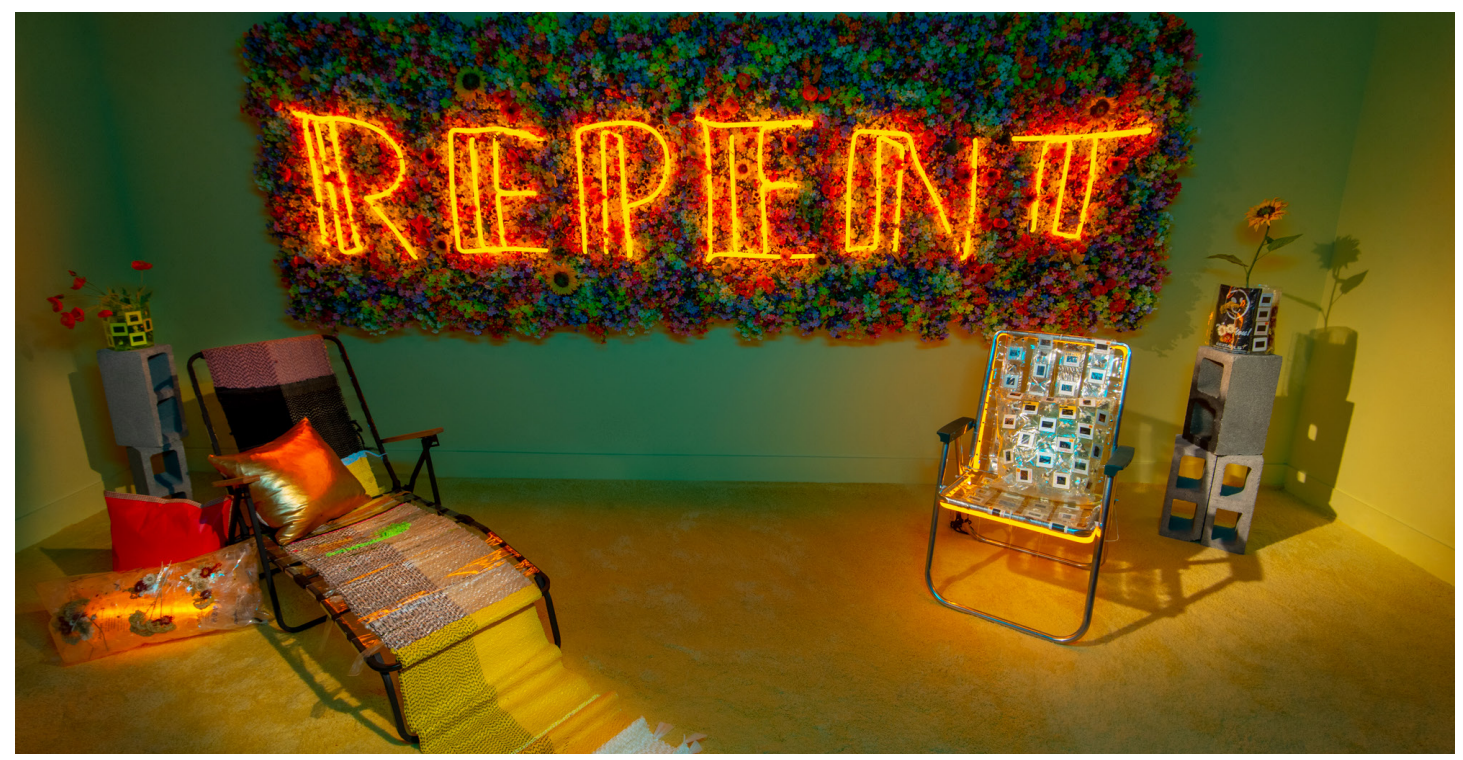
Meryl Pataky (American, born 1983) with textile collaboration by Allie Felton. A Modern Guilt (installation view), 2020. Neon and mixed media; dimensions variable.