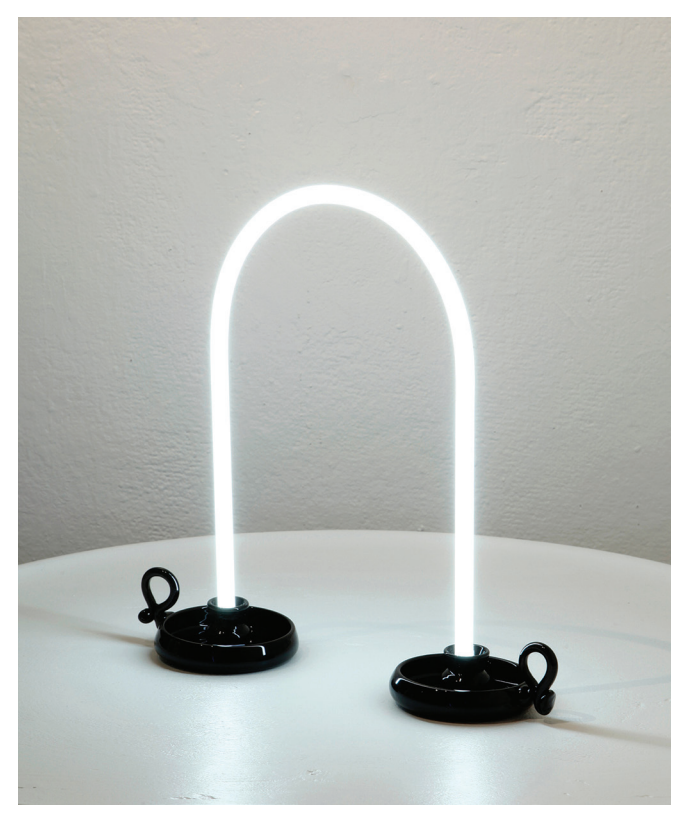
Victoria Ahmadizadeh Melendez (American, born 1988). a quiet life, a couple of times over , 2021. Blown glass, argon, and mercury; 14 × 14 × 5 in.