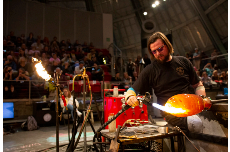
2022 Glass Art Society Conference

Museum of Glass welcomes over 100,000 total visitors each year. Museum of Glass has programs that minimize financial barriers, such as free library passes, EBT reduced admissions, free student admission, free summer admission for Military families, and special free days and evenings.