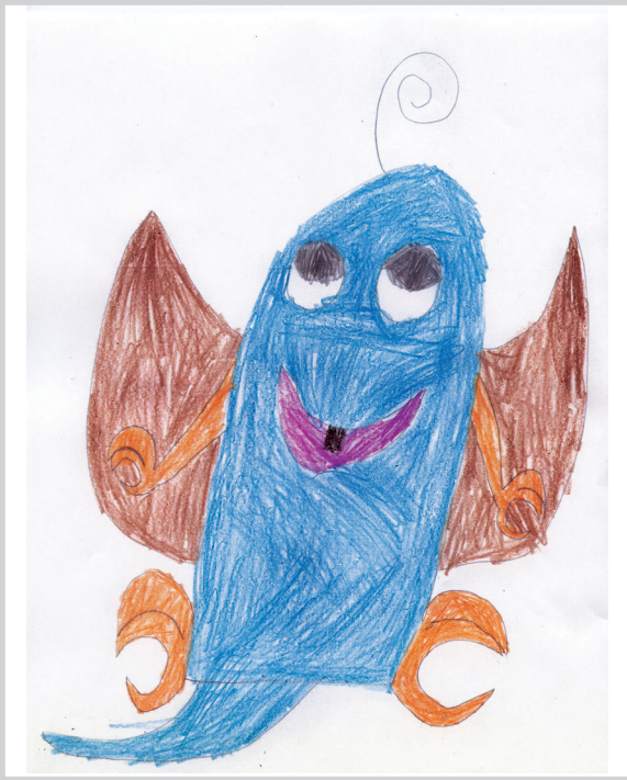
Pip, 2007 Cameron Day Age 8