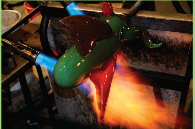
Creation of Pip in Museum of Glass Hot Shop.